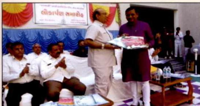
Inauguration of "Saraswati" Girls hostel at College of Agriculture, Mota Bhandariya (Amreli)